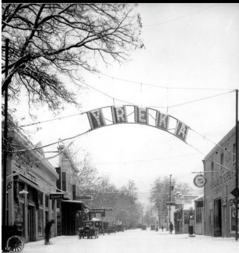
Historic Yreka Sign

The City's utility account set-up fee covers the staff time and other expenses associated with setting up new accounts. These expenses include administrative costs associated with account setup, reading water meters at the beginning and end of an account, turning water on for new customers and other related tasks.