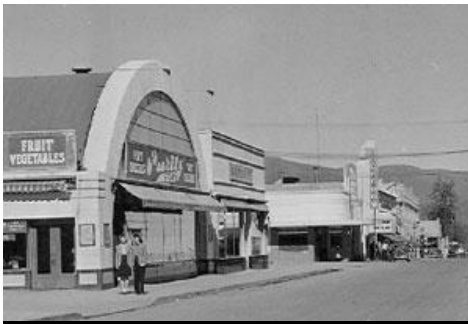
Historic Yreka Businesses